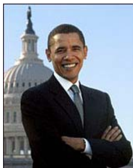
President Obama's photo hangs behind the Speaker's desk along with Presidents Abraham Lincoln

The Iowa House had an ROTC honorary color-guard from North High School in Des Moines precede a committee of four, who carried a picture of President Obama to replace the picture of President Bush.